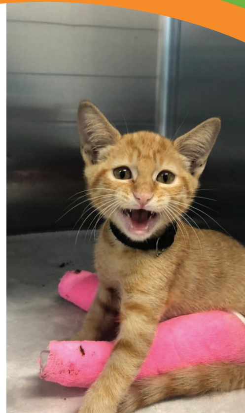
Mustang sends you a meow of thanks.

If you'd like to help us save more pets like Mustang, visit jaxhumane.org/donate and select "Medical Fund".