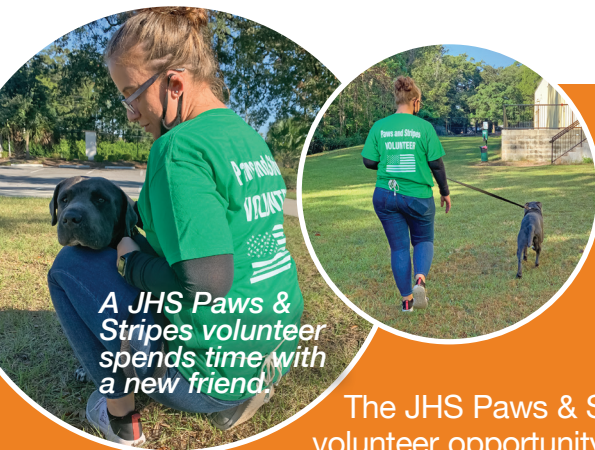
A JHS Paws & Stripes volunteer spends time with a new friend.