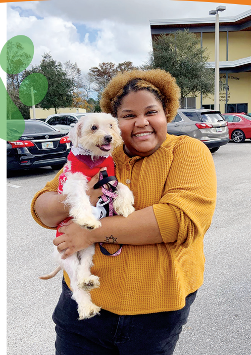
Sourdough and his new mom on adoption day.

If you have a special interest in supporting animals like Sourdough, be sure to save the date for Toast to the Animals, our premier fundraising event for the JHS Medical Fund, coming September 28, 2022, to TIAA Bank Field.