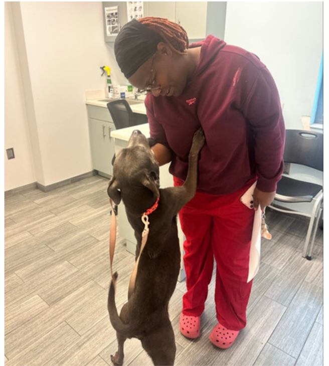
Jessi reunited with her owner, 2026

Visit jaxhumane.org/donate or call 904.725.8766 to give today.