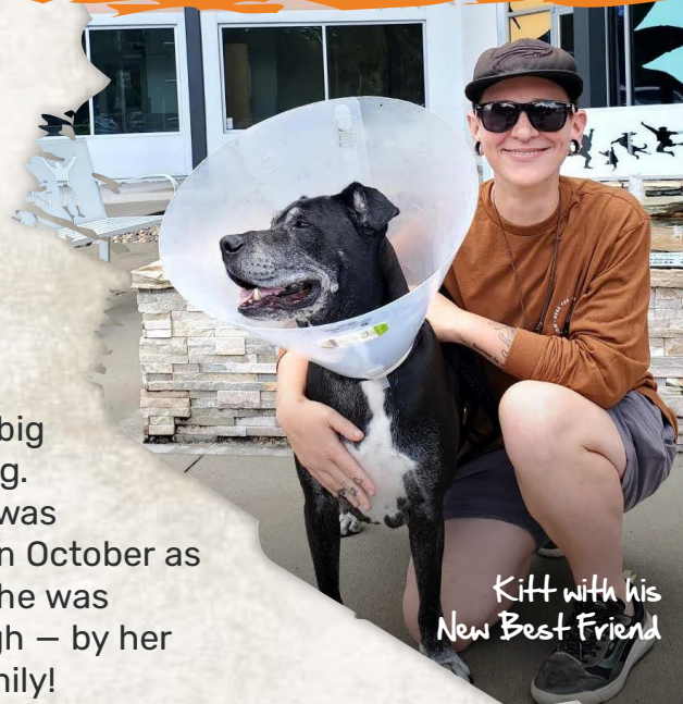
Kitt with his New Best Friend

With your support, we can continue to make a difference in the lives of pets like Kitt, Duckling, and the other 10,860 dogs and cats we cared for in 2025. Visit our website at www.jaxhumane.org and follow us on social media @jaxhumane to learn about how you can get involved in our mission.