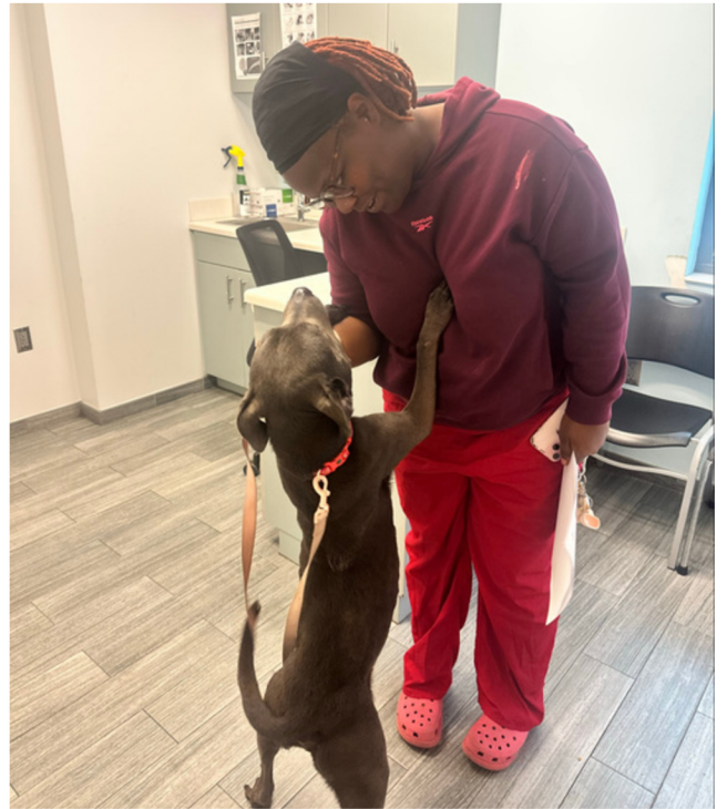
Jessi reunited with her owner, 2026

Visit jaxhumane.org/donate or call 904.725.8766 to give today.